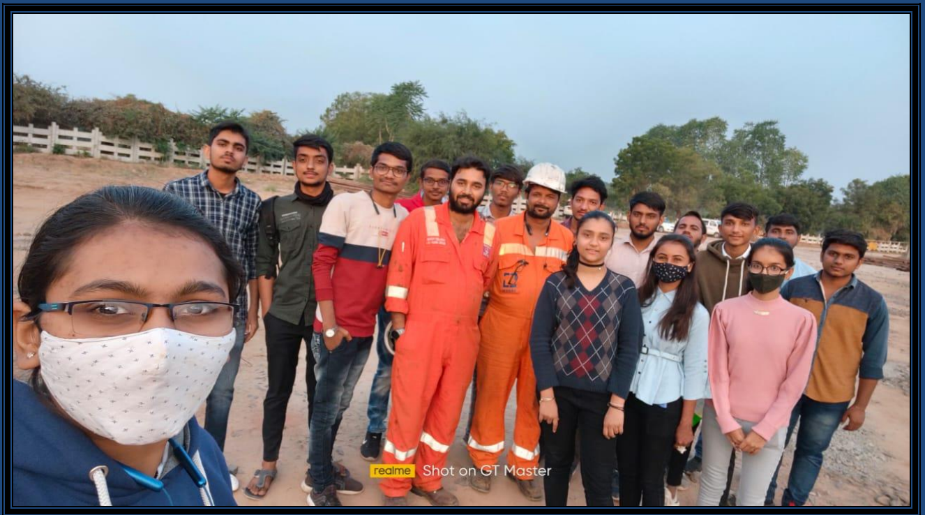
The visit organized for ONGC oil and Gas division under ajadi ka amrut mahotsav.